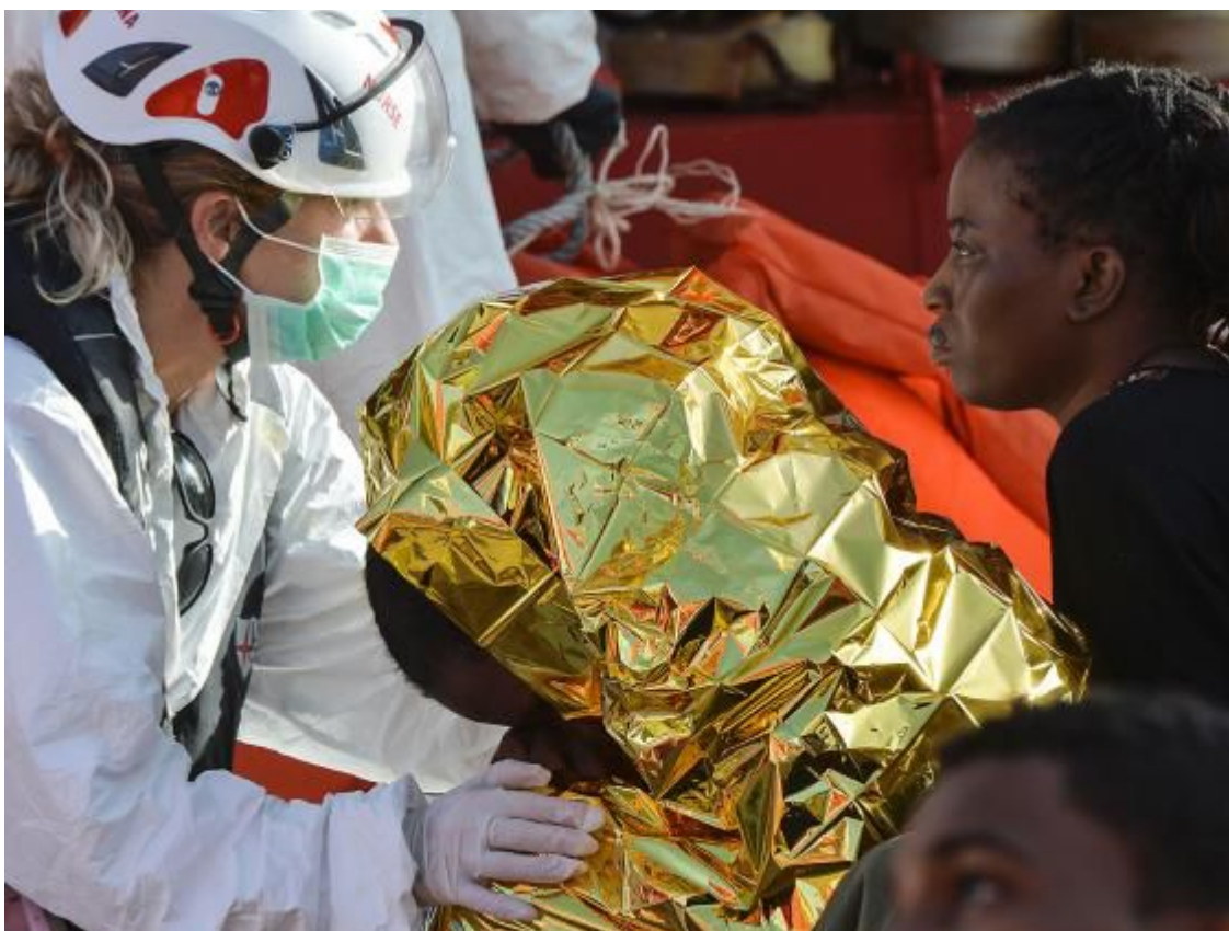
A female doctor speaks with women aboard the Topaz Responder ship run by Maltese NGO Moas and the Italian Red Cross during a rescue operation of migrants and refugees.